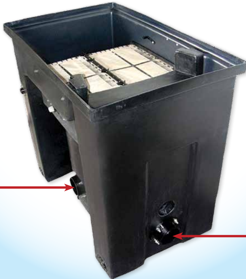
4" socket or groove outlet