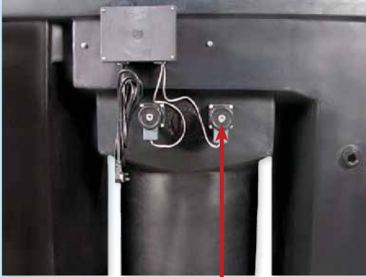
Long life 24VAC